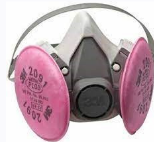
3 M Series