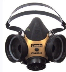
MSA Comfo II