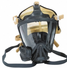
MSA Ultra Elite